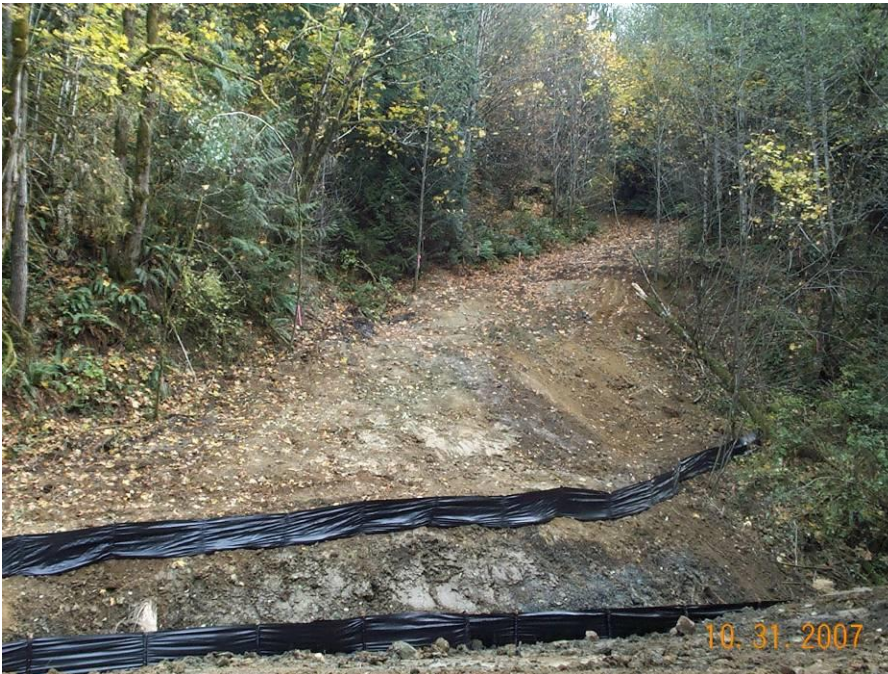
Post-Project looking across creek channel, following removal of road fill and culverts (prior to planting activities)