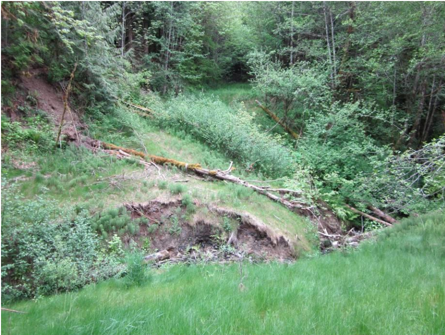
Year 3: May 2011