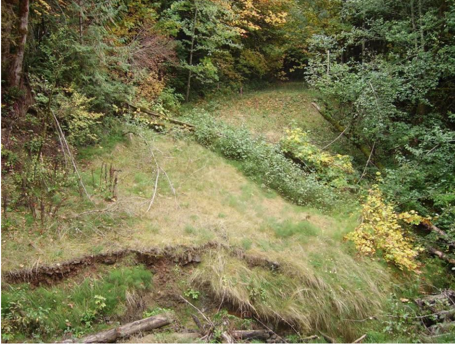
Year 1: May 2009