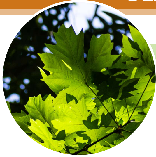
Big Leaf Maple